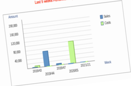
Last 5 weeks Performance (06/10/2021)